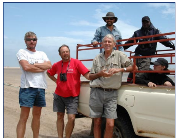
Top: The counters come from all walks of life; Saturday's team gathers for lunch at the Lookout