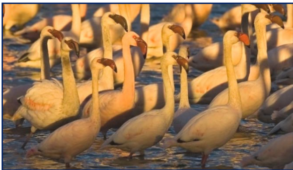
Flamingos are particularly vulnerable to collisions with power line structures, due to their habit of flying at night; both Lesser Flamingos (above) and Greater Flamingos are classed as Vulnerable