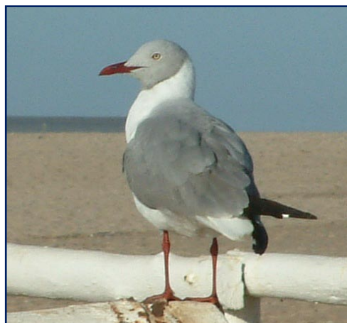
Top to bottom: First Madeiran Storm Petrel in Namibia Ringed Chestnut-banded Plover Ruddy Turnstone Grey-headed Gull in breeding dress