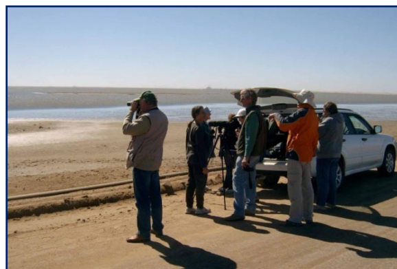
Bird counters busy at the Walvis Bay Ramsar site, July 2009