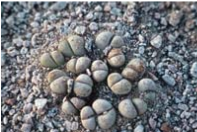
Common name: Lithops rushiorum Where they occur? In the Central and Northern Namib.