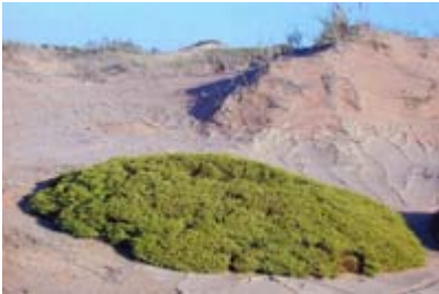
Common name: Kuntze's brownanthus Where they occur? From south of Walvis Bay to Southern Angola. It grows exclusively on sandy habitats.