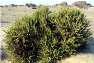
Common name: Pencil Bush - © N. Cadot Where they occur? Everywhere along the coastline in the fog belt. It grows only on gravel plains. This species is able to reverse transpiration absorbing water through the leaves and transporting it down to the roots.