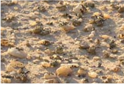
Common name: Foliose Lichens / Xanthomaculina species Where they occur? Central Namib.