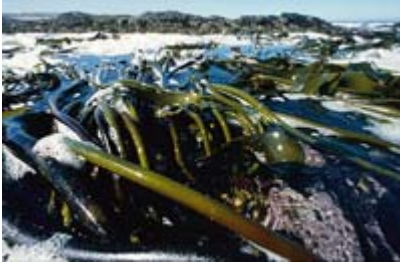
Common name: Kelp - © DLIST Where they occur? Everywhere along the coast.